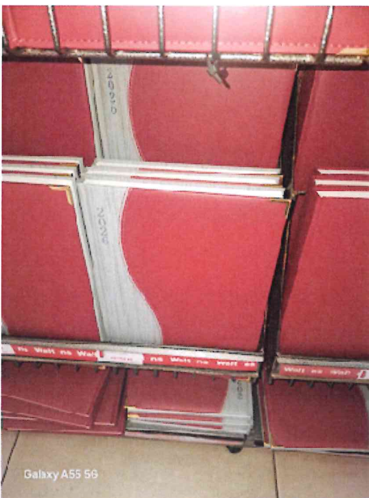
Black and Grey 2026 Diary A5 A-Day deluxe 2 tone padded stitch corners