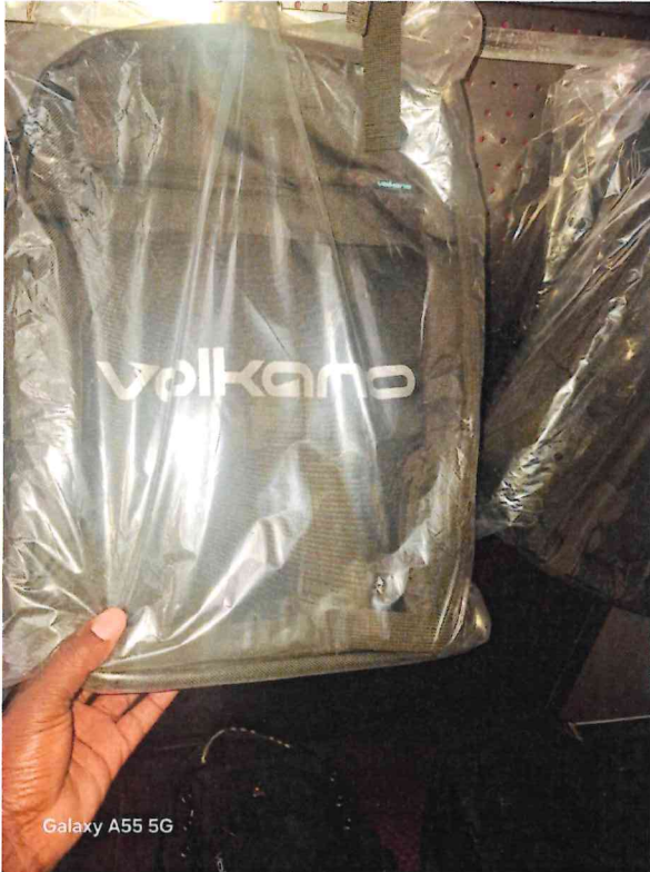
Black Volkano Sauve Backpack large

Roads Authority, Tshapumba Towers, 1 st Floor